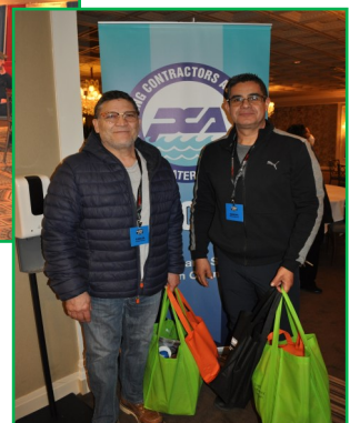
PCA members attending our "Break Away" event