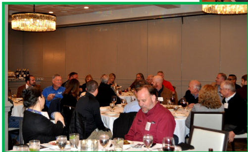
Round table introductions of attendees