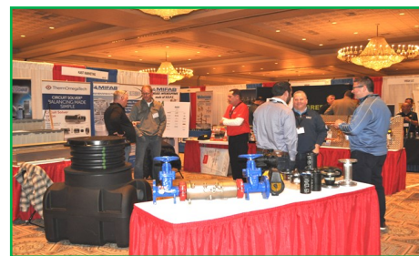
Expo exhibitors visit with attendees