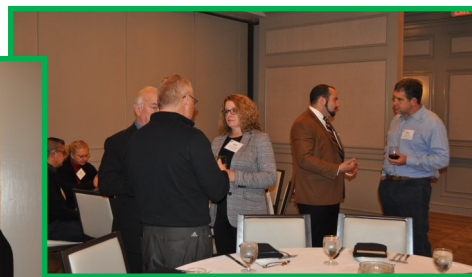
PCA members enjoying social hour