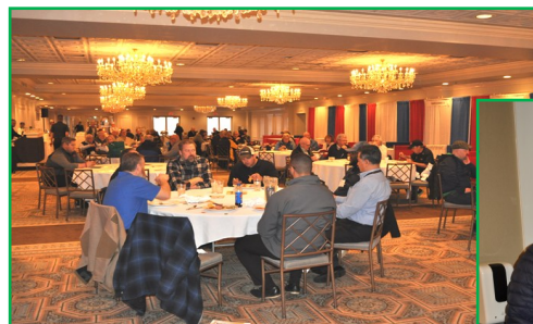
Expo attendees enjoy dinner after a full day of classes and walking the Expo floor.