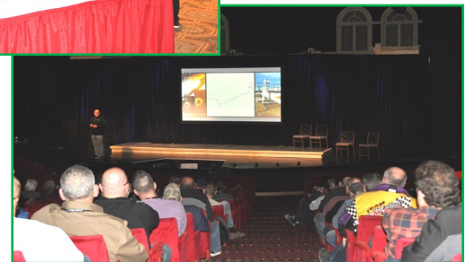
The morning CE class was a full house